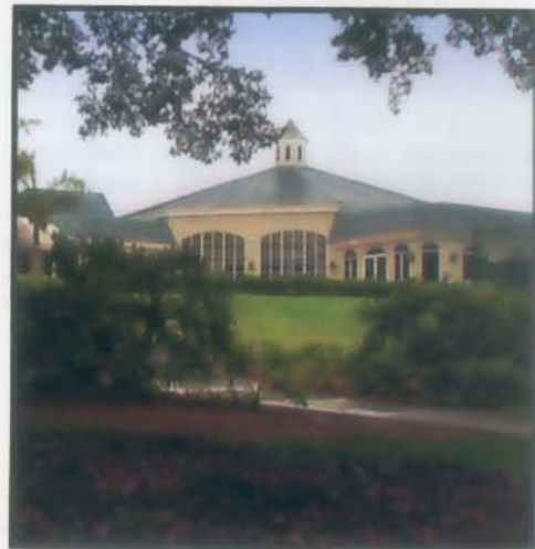
The Clubhouse at Naples Tennis Club and Resort.

the Sony Ericsson to make everybody know that we're here. Hopefully many will pass by because we will do lots of promos for the academy in Naples.