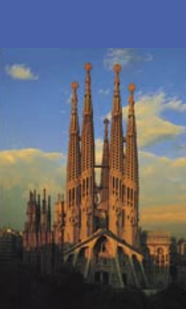
Sagrada Família, Barcelona

Schiller International School is located one Florida's Gulf Coast in beautiful Naples. The campus is within a short driving distance from many attractions. It is an hour and a half drive from Miami; three hours from Tampa; and two and a half hours from Orlando and Key West. The Southwest Florida International Airport (RSW) is a short 30 minute drive to your campus. The United States Tennis Association named Naples Bath and Tennis Club one of the Outstanding Tennis Facilities and has been rated as one of the Top 25 tennis facilities in the United States.