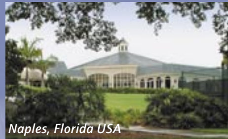
Naples, Florida USA